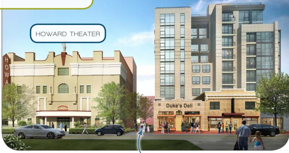
7TH STREET RETAIL RENDERING